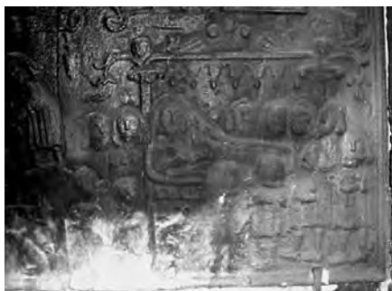
Fig 4: Jacob on his deathbed

the entire left half of the fireback, is taken from Genesis Ch. 37: vv. 20-24 & 31-33. In the middle, Joseph is being cast into a pit (which looks more like a well shaft) by one of his brothers, while above, six of his brothers look on, in a serried rank, each dressed in a cloak and wearing a sober puritan hat. Below, another brother presents their father, Jacob, with Joseph's coat, and from Jacob's mouth a speech bubble issues forth, with the words: AH·IT·IS·MY·SOHES·COTE. The bottom right quarter of the fireback shows the scene in Genesis Ch. 49, where Jacob, on