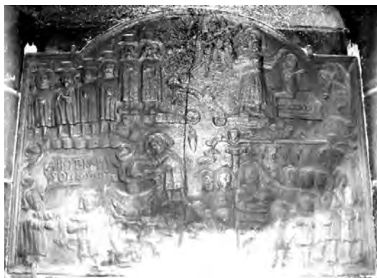
Fig 1: Fireback at Squerryes Court

A presumption against graven images, engendered by the reformation and the growth of fundamental protestantism, may have been the cause of the disinclination among English