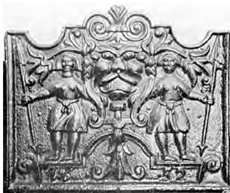
Fig 12: Fireback portraying the 'Brede Ogre'

the figures, and the use of the distinctive scroll suggest they also originated at Brede. One also bears the initials 'IM'. The same facial features and two-arched format appear on an unusual forgeback, dated 1655, which is in Hastings Museum (Fig. 11). Of the same date is a fireback (Fig. 12), said to portray the celebrated 'Brede Ogre', Sir Goddard Oxenbridge (d.c.1531), the design of which incorporates the same naïve facial features, uni-directional feet, and