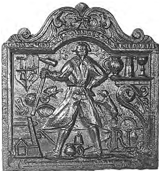
Fig 8: The Lenard fireback

A question which is often asked in relation to firebacks, but is rarely easy to answer, is that of origin. In the case of the Squerryes fireback a number of clues suggest where it may have been cast. The figuration is rather naïve and this offers the first clue as to the possible source of the plate. Comparison of the facial features of the figures on the Squerryes plate and that of Richard Lenard, the founder at Brede, on the celebrated fireback of 1636 (Fig. 8), show them to be remarkably similar. In both