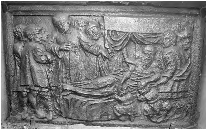
Fig. 7: Fireback at Wakehurst Place, Ardingly

Squerryes plate, and may also be a product of the same furnace. Recently noted is an illustration of the same scene on a bronze mortar, cast by Herman Benninck of Lübeck, in north Germany, which was recovered from the wreck of the Snaresvend , lost in 1658. 2 A fireback with the scene of the death of Jacob; again almost