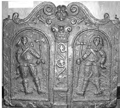
Fig 10: German influenced fireback at Guildford

Other firebacks that may have originated from Brede also show similar naïve representation of the human form and distinctive scrollwork, as well as other elements which suggest a continental influence. As mentioned above, early German stoveplates often used architectural forms with statuesque figures, usually religious ones, framed by gothic tracery. Such forms found their way into fireback design,