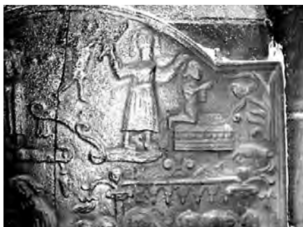
Fig 2: Abraham sacrificing Isaac

founders to cast religious subjects on firebacks, and to concentrate on heraldic or personal designs. There is, however, one striking exception to this rule: a remarkable fireback decorated entirely with scenes from the Old Testament, and including a caption in a speech bubble. The fireback (Fig.1), of which only one example is known to the author, is at Squerries Court, near Westerham, in Kent, where it has been for as long as anyone can remember, and possibly was used in the previous house on the site, which was replaced in 1680. In many ways the design on this fireback is very modern in concept, being akin to a strip-cartoon, yet the style of the dress of the figures portrayed and the overall appearance of the plate suggests that it was made in the first half of the 17th century. The fireback is in the form of an arched rectangle, measuring 960mm wide by 750mm high. It has a moulded border, but otherwise the entire surface is taken up with three pictorial scenes.