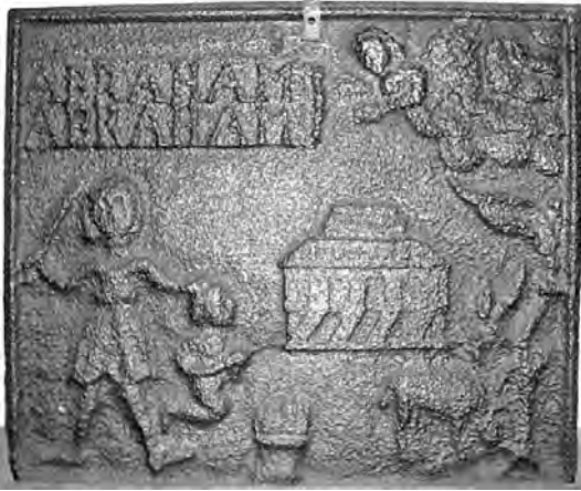
Fig. 6: Fireback at Rottingdean Grange

the position of the ram, what Isaac is kneeling on, and whether the angel is restraining Abraham. Another English fireback of Abraham and Isaac, at Rottingdean Grange (Fig. 6), bears some similarity in the representation of the pyre with the same scene on the