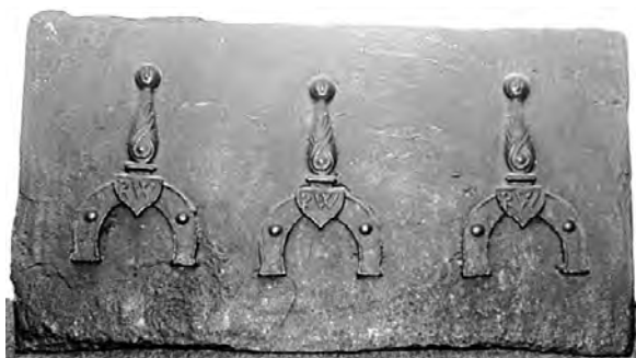
Fig.1: Fireback attributed to Woodman

The area was described as having 'water-courses, water-lays, ponds, bays, banks, pens, dams, flood-gates, sluices, ways, workmen's houses, coal places, mine-places and other grounds adjoining'. This 1617 description from a conveyance refers to Rushlake Furnace. 2 Just to the west of Warbleton church lived, in the 1550s, a bold and radical man called Richard Woodman who ran either a forge or a furnace at TQ 603176 (named 'Woodman's'). 'Firm facts are short for this site....The Woodman ascription is unproven: he was active at this time, for immigrants made charcoal for him in 1549 and 1550....but it is not known for certain where he worked'. 3 His entry in Straker states that he owned Woodman's Furnace ('a very large bay, by tradition the site of Woodman's Furnace') and also that he owned or worked Steel Forge and Markly Furnace at Rushlake Green. 4 Molly Beswick, however, argues that Markly was a later furnace, perhaps built by Stollian and that Woodman's furnace was Cralle (Cowbeech). 5 Interestingly, an iron fireback in Hastings Museum, bearing three impressions of a firedog marked 'RW', alleged to