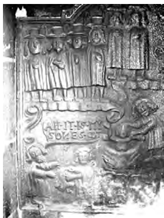
Fig 3: Joseph cast into a pit

Abraham about to sacrifice his son, Isaac, who is shown kneeling on a low wooden pyre (Genesis Ch. 22: vv. 6-13). Abraham's left arm rests on Isaac's head, and his right arm, which holds a cleaver, is raised behind him ready to strike. Above and behind Abraham, the figure of an angel is shown restraining Abraham's right arm while, below Isaac and to the right, a ram lurks, presumably unaware of the fate that is to befall him. The second scene (Fig. 3), which occupies