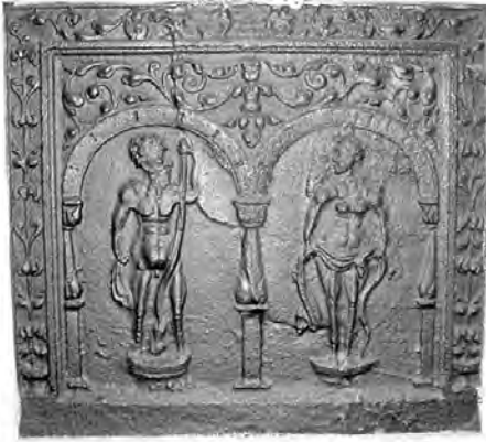
Fig 9: German fireback at Maison de la Métallurgie, Liège

cases they are stylised rather than realistic. This may indicate a deliberate choice on the part of the wood carver responsible for making the pattern, or may simply be the result of a lack of technical skill. Another similarity with the Lenard fireback is the fact that, with only one exception, all of the forward-facing, standing figures on the Squerryes plate have both feet pointing in a