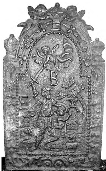
Fig 5: 'Dutch' style fireback at Lewes

his deathbed, tells his twelve sons what will befall them and their tribes (Fig. 4).