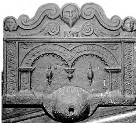
Fig 11: Forgeback in Hastings Museum

but as the influence of the Renaissance became more widely felt the architectural forms depicted on firebacks assumed a more classical appearance (Fig. 9). An English fireback of this type can be seen in two slightly different (but probably contemporary) versions at museums in Hastings, Lewes and Guildford (Fig. 10). All are poor castings, but the figuration, the poses of